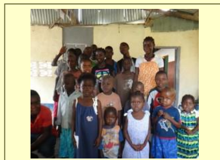
Children during a distribution of 'Little Dresses'